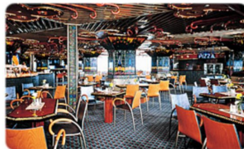
Total Choice Dining -- So many choices All meals included, even room service!