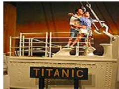
Fox Studio Tour, Ensenada